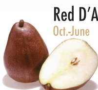
Red D'Anjou Oct.-June