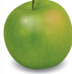
Granny Smith Sept.-All Year