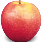
Cripps Pink Oct.-Mar.