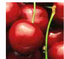
Red Cherries June.-Aug.