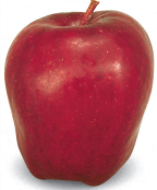
Red Delicious Sept.-All Year