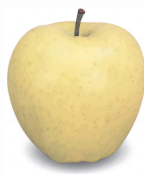
Golden Delicious Sept.-Aug.